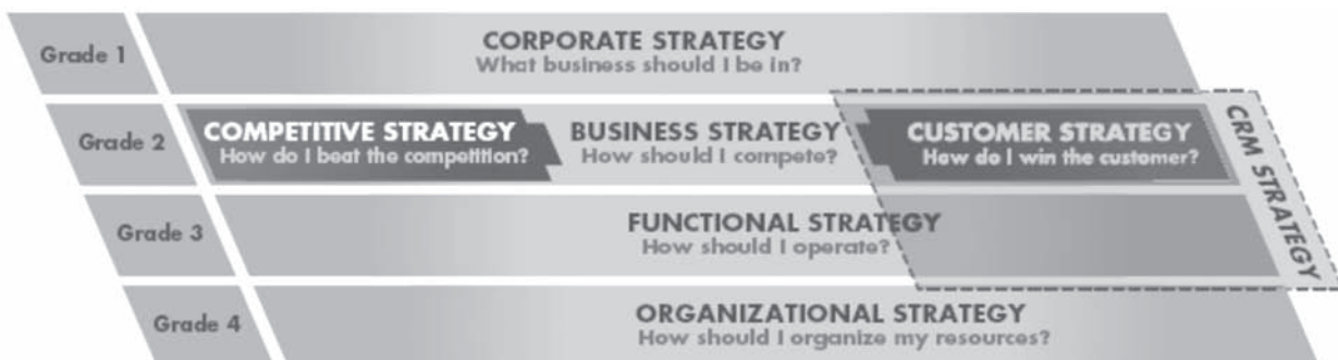
Fig 3. Grades of Strategy and CRM Strategy Fit [36]

Moses states, that CRM strategy is generally accepted as a form of “functional” or “operational” strategy (Grade 3), as it introduces a flood of possibilities for new tactics and tools to improve operations. But the key point is to recognize that a company should not