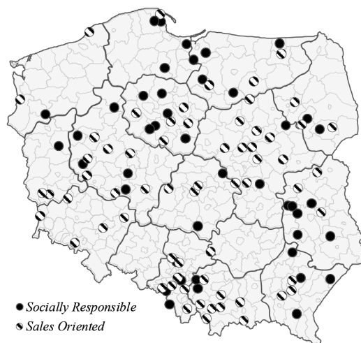
Figure 2. Geographical distribution of head offices of SLBs following the two represented Facebook activity models (source: author's own presentation)

The analysis begins with a k-medoid clustering, which allows to identify the unique Facebook activity models of SLBs. The results of the clustering are presented in Table 3. Two clusters of banks are distinguished. The first includes 64 banks that devote their Facebook activities mainly to describing product offers: the medoid – a group representative – conveys product offers in 40.3% of its posts. Taking into account that an additional 8.9% of posts are advertisements that do not reference the bank's products, almost 50% of posts of this cluster's medoid have an economic connotation. Additionally, banks within this cluster inform their Facebook followers about charitable, social, or local issues to a minor extent. Taking these specificities into account, banks from this cluster are called Sales-Oriented. The second cluster is constituted of 44 SLBs. The medoid of this group conveys information about charitable activities in 9.4% of posts, 21.5% of posts are devoted to the bank's social issues, and 13.4% convey local news. Thus, 44.3% of posts can be treated as a representation of socially responsible disclosures, as compared to only 21.4% of such posts published by the medoid of the first