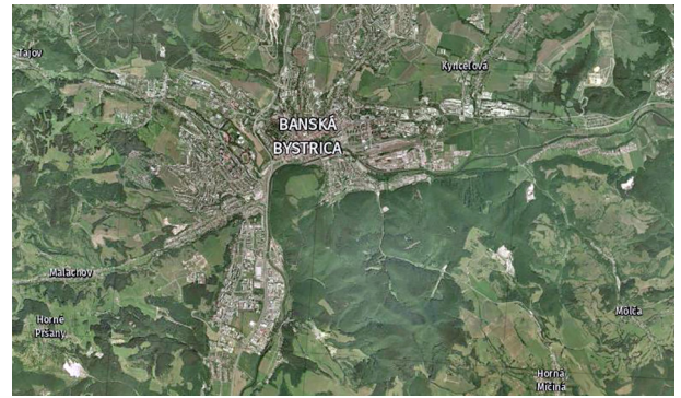
Fig. 4. Example of labels above the orthophotomap

However, there are several limitations of our data styling in the WMA, with regard to styling in general rather than SLD styling. Issue, which is most pronounced for health and demographic data and municipality level of territorial units, is rate reliability. Many