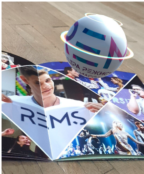
Figure 1. Augmented reality perpetuum mobile composition, application REMS Companion App (source: created by author)