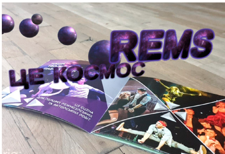
Figure 2. Augmented reality composition, REMS Is Cosmos , application REMS Companion App

Figure 1 shows a graphic model of the planet with REMS Companion App logo, which turns around and moves along a certain trajectory, thus symbolizing – perpetuum mobile – the constantly moving process of learning and development for creative potential of the students of the DVASD.