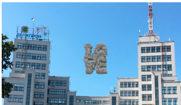
Figure 3. Augmented reality composition LOVE in the case of Kharkiv, Ukraine, application MININ Art

While in the case of the REMS Companion App the sculpture concept is a typographic composition LOVE , consisting of just four letters, a replica of a sculpture by the Indiana. The virtual content is integrated using marker technology, in the case of the LOVE composition using REMS Companion App , a global positioning system (GPS) coordinate is used that must be in the centre of the frame. To see the artwork, one has to hold the phone horizontally before launching the camera, then flip it upside down and point the device at the facade of the building. In this way, due to digital mark-up technology, it becomes possible to place sculptures all over the world: against the background of historical sites in European cities,